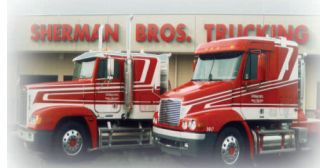
Sherman Bros’ Family of Companies

You could have the chance to be declared one of SBI’s “Driver of the Month” for the chance to win a prize. Anyone from S.B. Inc, can nominate you !! If you are accident/ticket free and picked as an exemplary driver, then you are also eligible to be amongst those placed in the prize drawings for Driver Appreciation Week.